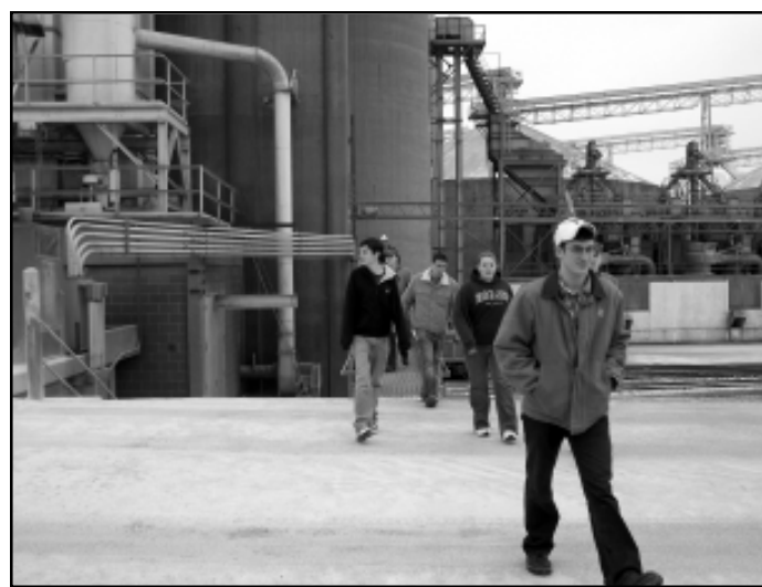
FFA students from Heritage, Mahomet-Seymour, St. Joseph-Ogden and Unity High Schools participated in the Young Ag Leaders FFA Acquaintance Day on January 18. The group toured Stone Ridge Dairy, a wind farm and The Andersons grain elevator.

This year, about 40 FFA students from Champaign County participated in the Acquaintance Day program that included tours of Stone Ridge Dairy in Bellflower, IL, a wind farm near Ellsworth, IL and The Andersons in Champaign. During lunch, two members of the committee explained Farm Bureau and what opportunities are available for them to get in-